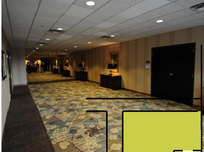
Exhibit Area Looking Toward Salon C

Register on-line www.holidayinn.com/hiattheplaza Attendee Code ADDA